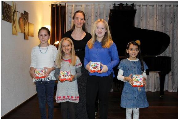
All smiles after our studio recital!